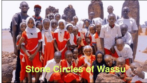
Stone Circles of Wassu

The SCHOOL TRIPS we funded for Grade 5 and 6 pupils have proved so successful we have committed to fund these on a bi-annual basis to ensure that pupils have an opportunity to travel outside their area and visit various sites of interest in The Gambia and to open their eyes and minds to opportunities before leaving to attend Upper Basic schools for further education.